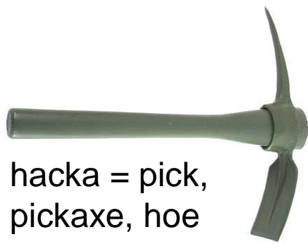
hacka = pick, pickaxe, hoe