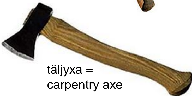
täljyxa = carpentry axe