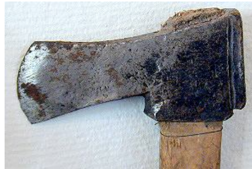
huggyxa = carving axe