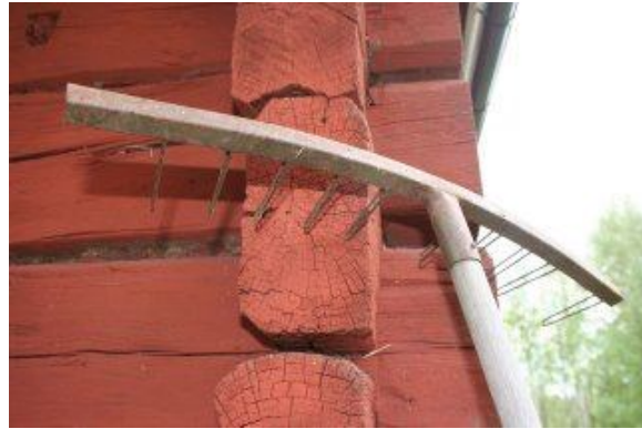
harka, räfsa, kratta = rake