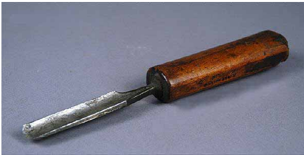
huggjärn = chisel